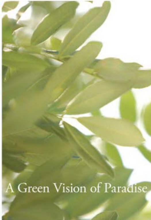
A Green Vision of Paradise