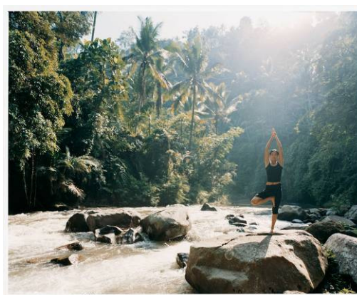
This image can be downloaded at: http://www.como.bz/download/cse/yoga_on_ayung.jpg