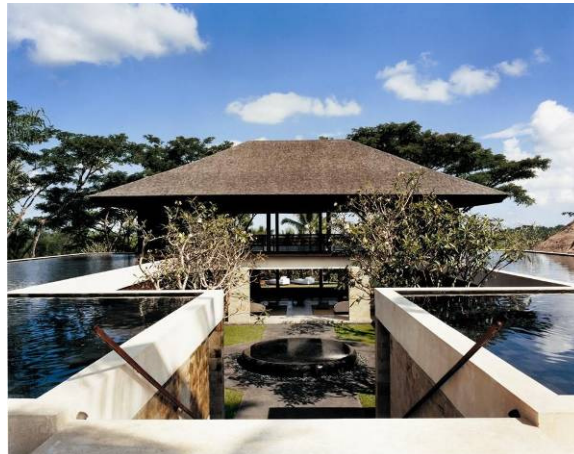
This image can be downloaded at: http://www.como.bz/download/cse/Ojas_spa_building.jpg

FOR MORE INFORMATION: COMO Shambhala Estate at Begawan Giri PO Box 54 Ubud 80571, Bali Indonesia Tel: +62 361 978888 Fax: +62 361 978889 Email: res@cse.comoshambhala.bz Website: cse.comoshambhala.bz