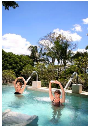
This image can be downloaded at: http://www.como.bz/download/cse/Vitality_Pool_3.JPG